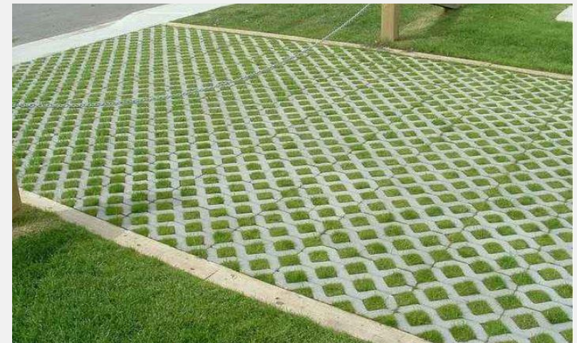
EXAMPLE OF PERMEABLE PAVING FINISH TO CAR PARKING AND ACCESS PATHS