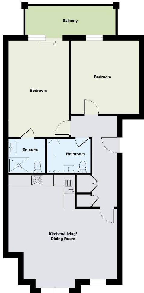
Flat 4 Approximate Floor Area 807 sq. ft (75.00 sq. m)

Approx. Gross Internal Floor Area 807 sq. ft / 75.00 sq. m