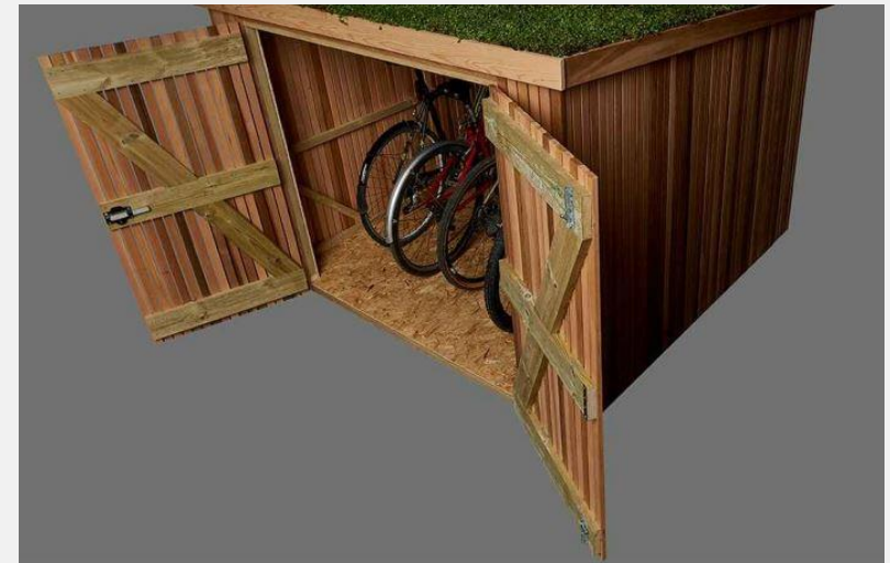
EXAMPLE OF SECURED SLOT IN BIKE STORAGE

Approx. Gross Internal Floor Area 659 sq. ft / 61.20 sq. m