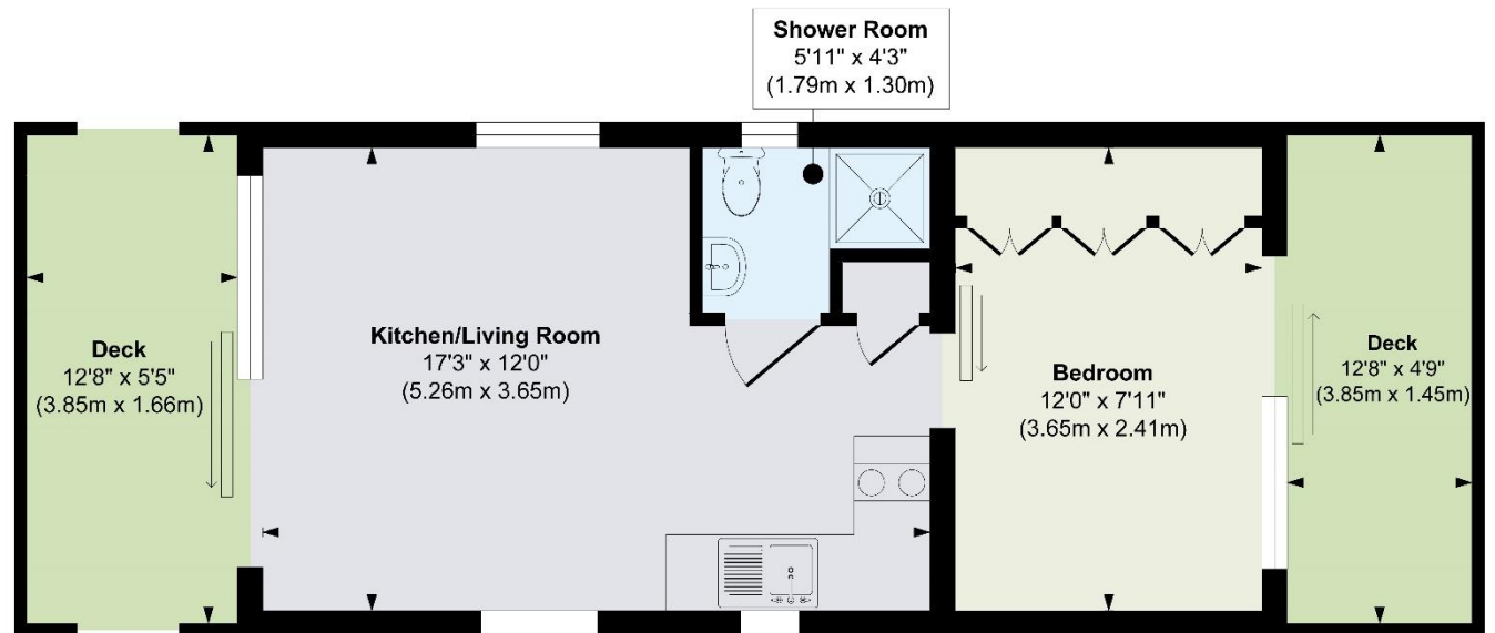
Floor Plan Approximate Floor Area 309 sq. ft (28.72 sq. m)